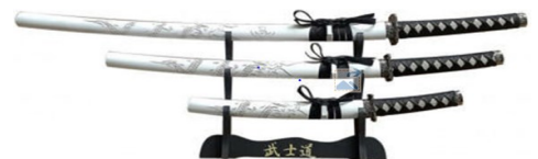
Grand Champion Awards